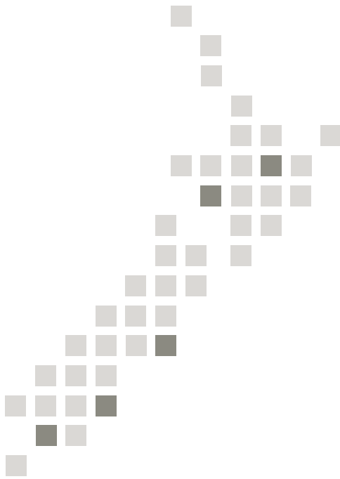
Top Districts – Christchurch City, Dunedin City, Wanganui District, Rotorua District & Invercargill City