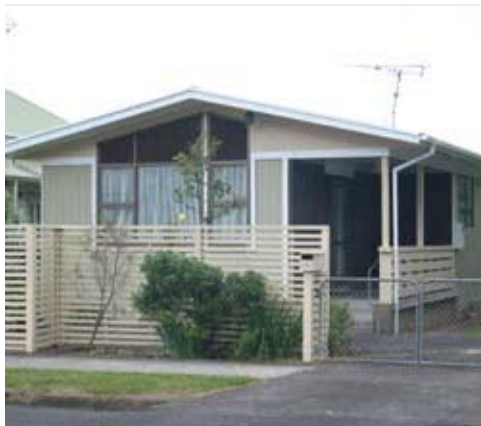
Top Suburbs – St Kilda, Rotorua Central, Caversham, South Dunedin, Wanganui Central, New Plymouth Central, Phillipstown, Glenholme, New Brighton North & The Wood