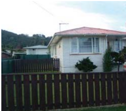
Top Suburbs – Flaxmere, Kaiti, Kawerau, Koutu, Opotiki, Kaitaia, Kaikohe, Fairfield, Western Heights & Naenae