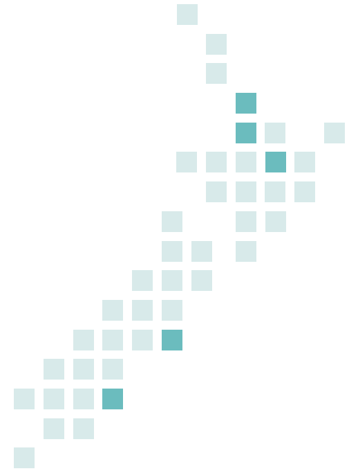
Top Districts – Dunedin City, Christchurch City, Auckland City, Waitakere City & Tauranga City