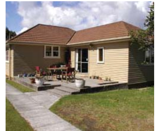
Top Suburbs – Musselburgh, Stanmore Bay, Whangaparaoa, Rangiora, Brookfield, Papamoa Beach East, Morningson, Helensville, Lyttelton & Andersons Bay