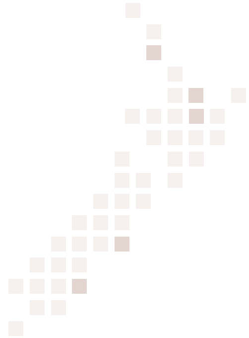
Top Districts – Tauranga City, Christchurch City, Rodney District, Thames-Coromandel District & Dunedin City Top Suburbs – Orewa, Greerton, Whangamata, Mosgiel, Otumoetai, Twizel, Waimate, Waikanae, Mangawhai & Tairua