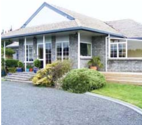
Top Suburbs – Otumoetai, Havelock North, Allenton, Whangaparaoa, Waikanae, Awapuni, Paraparumu Beach, Taradale, Richmond & Avonhead