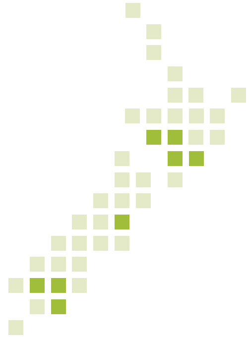
Top Districts – Hastings District, Matamata-Piako District, South Taranaki District, Southland District & Ashburton District Top Suburbs – Te Aroha, KIWITAHĪ, Twyford, Wairau, Paengaroa, Longlands, Meeanee, Te Puke, Tahuna & Manaia