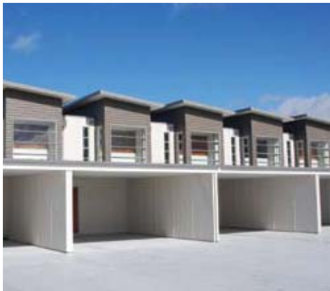
Top Suburbs – Auckland Central, Wellington Central, Christchurch Central, Riccarton, St Lukes, Edgware, New Lynn North, Linwood, Hamilton East & Grafton