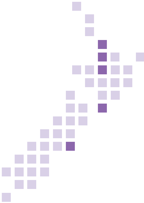
Top Districts – Auckland City, Christchurch City, Wellington City, Hamilton City & Waitakere City