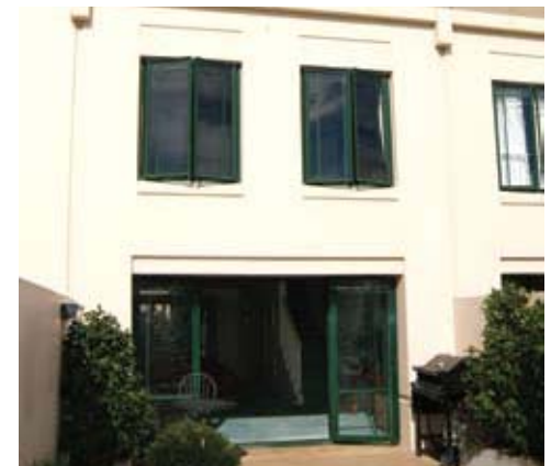
Top Suburbs – Auckland Central, North Dunedin, Dunedin Central, Silverdale West, Riccarton, Mount Cook, Wellington Central, North East Valley, Grafton & Hokowhita