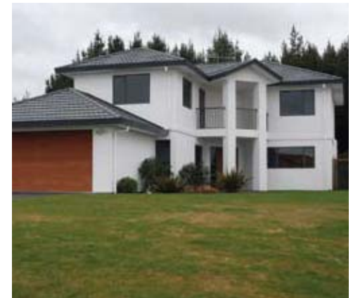
Top Suburbs – East Tamaki Heights, Rotorotuna, Albany South, Greenhithe, Parklands, Whangaparaoa, Henderson Valley, The Gardens, Whitby & Rolleston