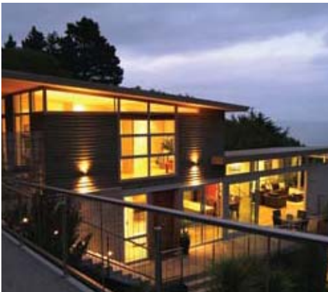
Top Suburbs – Cashmere Central, Khandallah, Mellons Bay, Mairangi Bay, Chatswood, Merivale, Mount Pleasant, Lower Hutt Central, Avonhead & St Johns