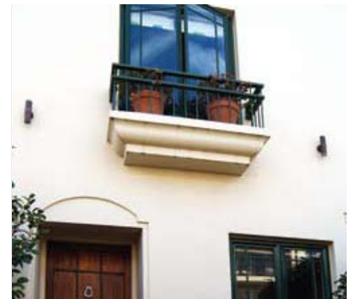
Top Suburbs – Bucklands Beach North, Milford, Takapuna, St Heliers, Hauraki, Parnell, Remuera West, Half Moon Bay, Hokowhitu & Botany Downs South