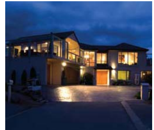
Top Suburbs – Remuera East, Remuera West, Kohimarama, St Heliers, Epsom South, Mission Bay, Epsom North, Herne Bay, Parnell & Orakei