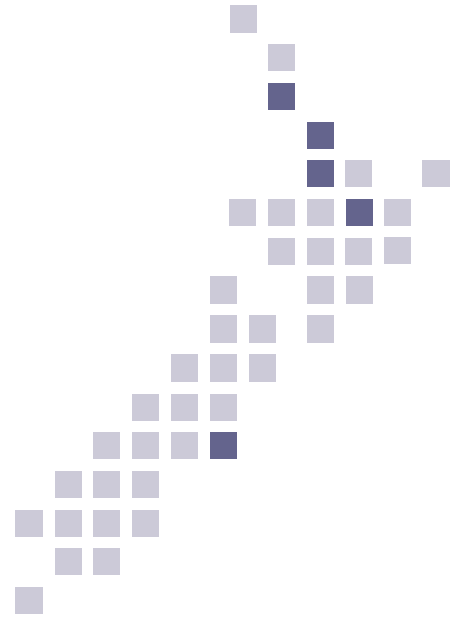
Top Districts – Auckland City, North Shore City, Christchurch City, Tauranga City & Manukau City