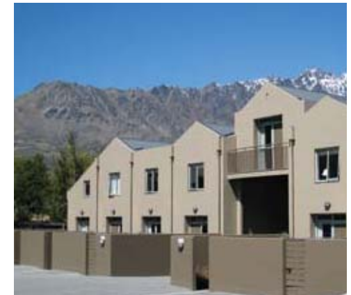
Top Suburbs – Grey Lynn, St Johns, Ponsonby, Mount Eden South, Northcote Point, Balmoral, Eilerslie South, Royal Oak, Orakei & Point Chevalier North