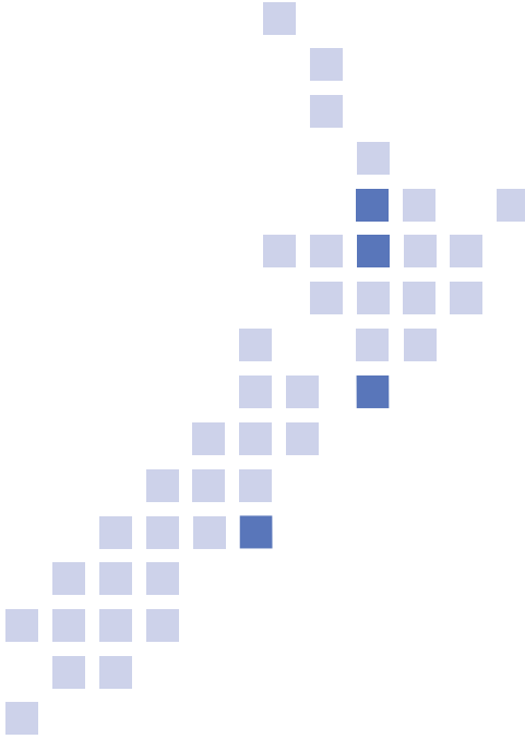
Top Districts – Manukau City, Waitakere City, Hamilton City, Lower Hutt City & Christchurch City Top Suburbs – Mangere East, Wainuiomata Central, Ranui, Clover Park, Papatoetoe West, Massey West, Flaxmere, Manurewa Central, Mangere Central & Clendon Park