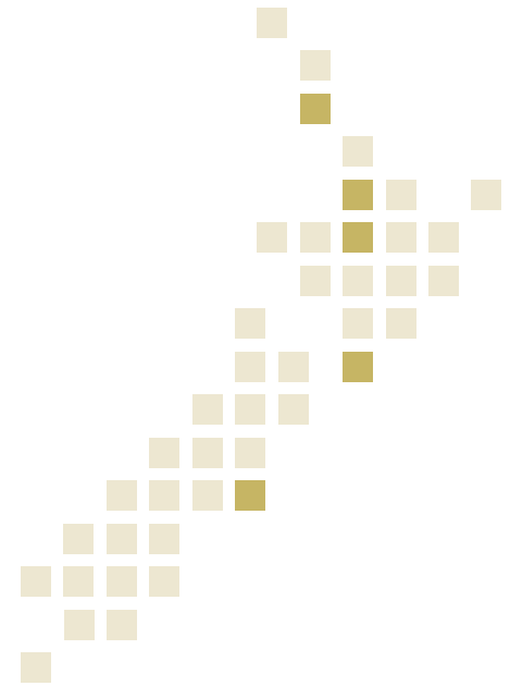
Top Districts – Manukau City, Christchurch City, North Shore City, Hamilton City & Wellington City