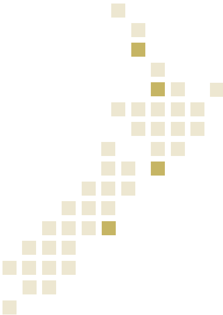
Top Districts – North Shore City, Manukau City, Waitakere City, Christchurch City & Wellington City Top Suburbs – Botany Downs South, Northcross, Torbay Heights, Whitby, Henderson Valley, Rothesay Bay, Karori Central, East Tamaki Heights, Tiritangi North & West Harbour